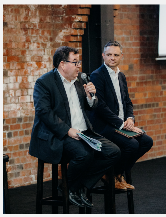
Hon Grant Robertson, Minister of Finance and Hon James Shaw, Minister for Climate Change at the Inaugural State of Sustainable Finance event

"I specifically want to acknowledge Toitū Tahua for the role that they've been playing in the transformation of the financial system. Toitū Tahua have been coordinating insights from across the sector and we have heard your feedback around closer engagement between government and industry." Hon James Shaw, Minister for Climate Change